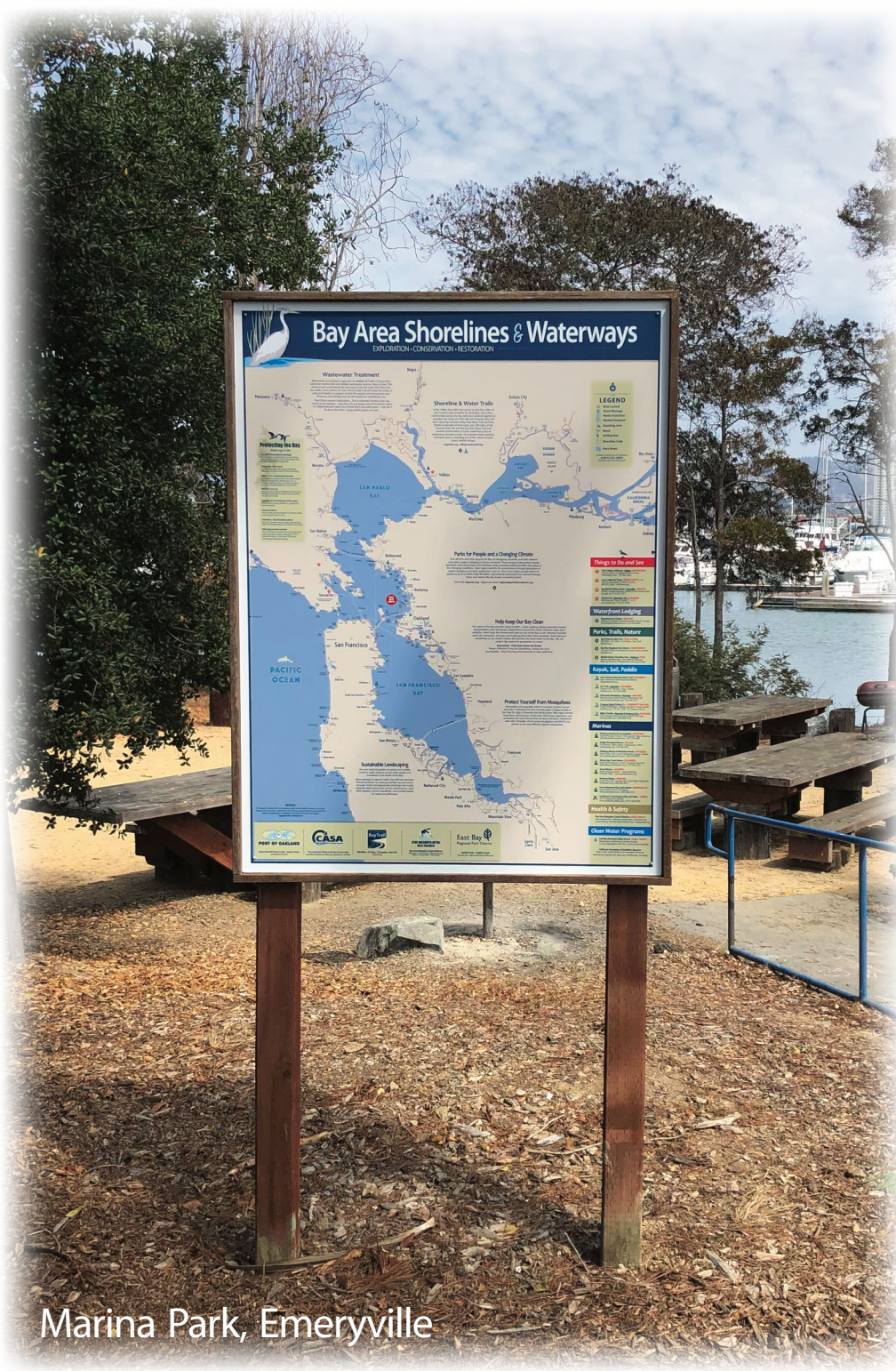
Marina Park, Emeryville