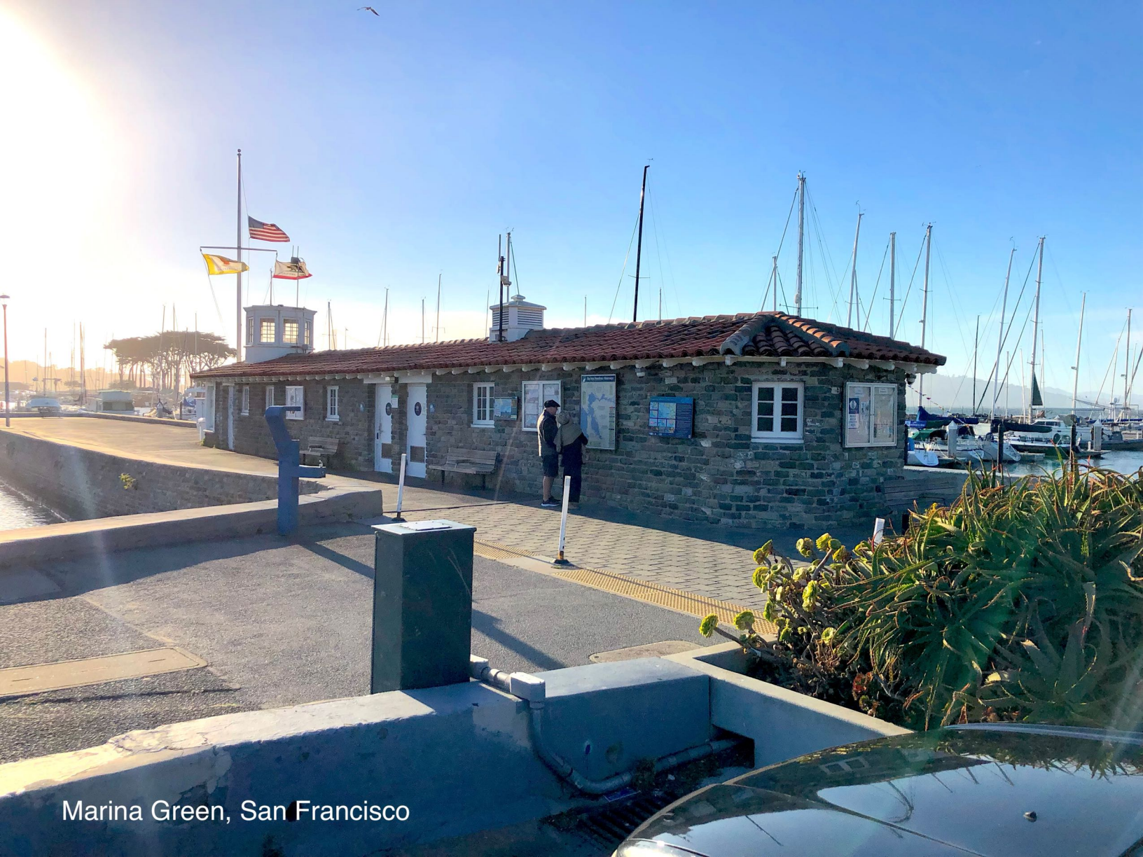
Marina Green, San Francisco